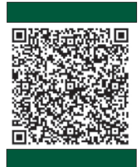
Learn More - QR Code